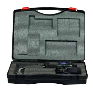
FG-3000R with Accessories in Included Carrying Case