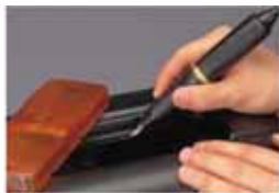
For Cutting and deburring of plastics