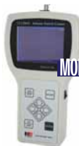
เครื่องวัดฝุ่น MODEL CLJ-H603