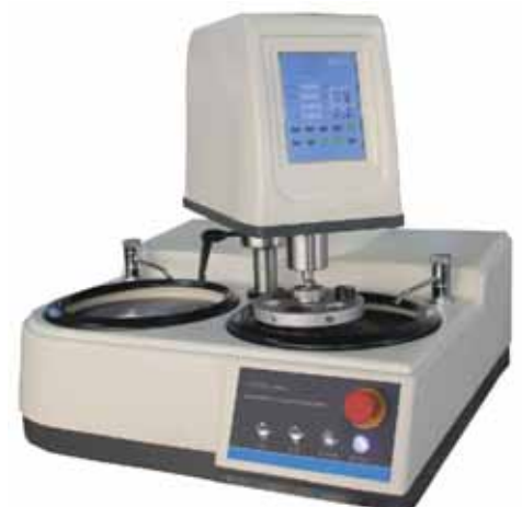
MODEL : METAPOL-2000X