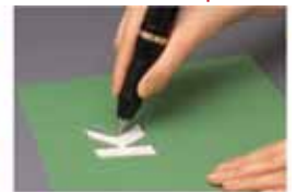
For Cutting rubber film, etc.