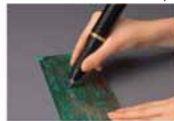
For correcting of PCB patterns