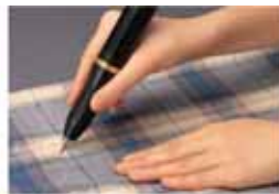
For Cutting of sheet, cloth, etc